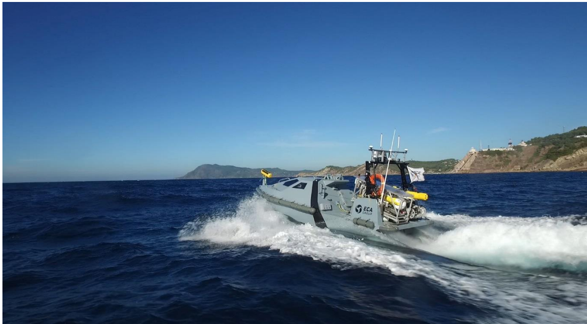
ECA Group's UMIS Unmanned Maritime Integrated System

The whole operation is supervised by an operator located onboard a ship far from the danger zone or on land. In this configuration, the minekillers are remotely guided by a radio link from the ship to the USV , then a wired (fiber optic) link between the USV and the inspection or combat minekiller.