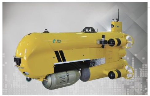
ECA Group PAP MK6 ROV : « Poisson Auto-propulsé » latest generation of “Self-propelled fish”

This explosive charge is activated by an operator using an acoustic signal so its explosion in turn triggers the explosion of the mine 4 .