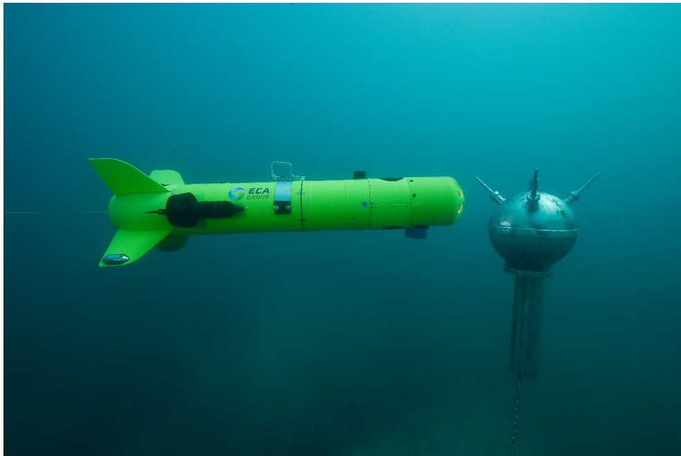
ECA Group's identifying ROV: SEASCAN MK2

As false alarms are not a rare occurrence in the subsea environment, it proved necessary to design a re-usable identification vehicle, without a shaped charge , derived from the combat minekiller for the sole purpose of identifying underwater objects or mines before eventually neutralising them. ECA Group has developed the K-STER I and the SEASCAN for this purpose.